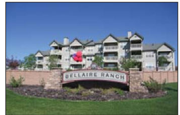
BELLAIRE RANCH Colorado Springs, Colorado $22,000,000 • 240 Units